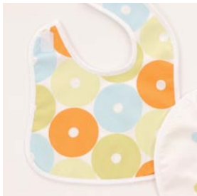
1. basic bib