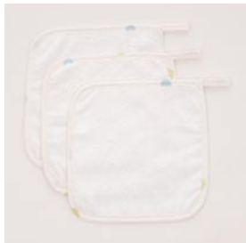
2. face cloths