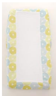
10. change pad cover