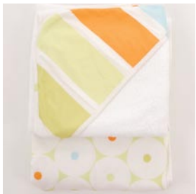
4. hooded towel