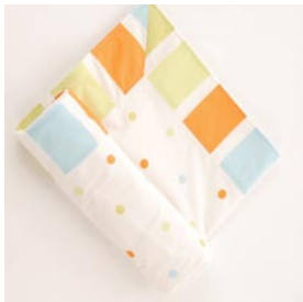
3. yummy blanket