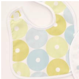
1. basic bib