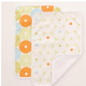
6. sit + spit cloths

1. basic bib: Our groovy bib that may just get your baby on the fashion pages. 100% cotton front with thin 100% terry back. 2. face cloths: It's much more fun to wash faces and have baths when your face cloth matches your towel. Just ask any Babylicious baby. 100% cotton. 3-pcs. 3. yummy blanket: Cuddle up and keep warm at home or on the go with this go-anywhere, hip blanket. 100% cotton with 100% yummy fleece. 4. hooded towel: Our hooded towel is a staple. Soft fluffy 100% cotton terry with a fun print on the reverse makes bath time hip. 5. receiving blankets: Made with 100% soft cotton flannel with funky prints. Wrap baby in something colourful. 2 pcs. 6. sit + spit cloths: The burp cloth reborn. 100% cotton top to look good and 100% terry backing for absorbency. 2 pcs.