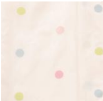
9. crib sheet