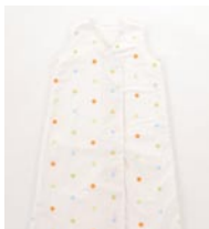
13. sleep cozy