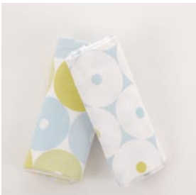
5. receiving blankets