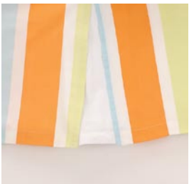
10. crib skirt