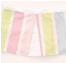
11. crib skirt