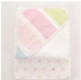
4. hooded towel