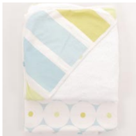
4. hooded towel