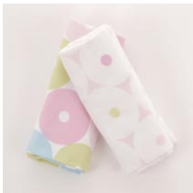
5. receiving blankets