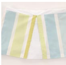
11. crib skirt