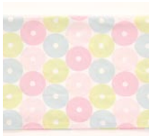
8. crib sheet