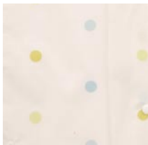
9. crib sheet