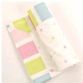
3. yummy blanket