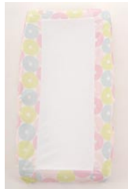
10. change pad cover