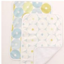
6. sit + spit cloths

1. basic bib: Our groovy bib that may just get your baby on the fashion pages. 100% cotton front with thin 100% terry back. 2. face cloths: It's much more fun to wash faces and have baths when your face cloth matches your towel. Just ask any Babylicious baby. 100% cotton. 3-pcs. 3. yummy blanket: Cuddle up and keep warm at home or on the go with this go-anywhere, hip blanket. 100% cotton with 100% yummy fleece. 4. hooded towel: Our hooded towel is a staple. Soft fluffy 100% cotton terry with a fun print on the reverse makes bath time hip. 5. receiving blankets: Made with 100% soft cotton flannel with funky prints. Wrap baby in something colourful. 2 pcs. 6. sit + spit cloths: The burp cloth reborn. 100% cotton top to look good and 100% terry backing for absorbency. 2 pcs.