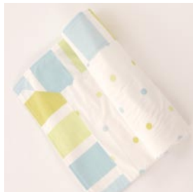
3. yummy blanket