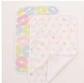
6. sit + spit cloths

1. basic bib: Our groovy bib that may just get your baby on the fashion pages. 100% cotton front with thin 100% terry back. 2. face cloths: It's much more fun to wash faces and have baths when your face cloth matches your towel. Just ask any Babylicious baby. 100% cotton. 3-pcs. 3. yummy blanket: Cuddle up and keep warm at home or on the go with this go-anywhere, hip blanket. 100% cotton with 100% yummy fleece. 4. hooded towel: Our hooded towel is a staple. Soft fluffy 100% cotton terry with a fun print on the reverse makes bath time hip. 5. receiving blankets: Made with 100% soft cotton flannel with funky prints. Wrap baby in something colourful. 2 pcs. 6. sit + spit cloths: The burp cloth reborn. 100% cotton top to look good and 100% terry backing for absorbency. 2 pcs.