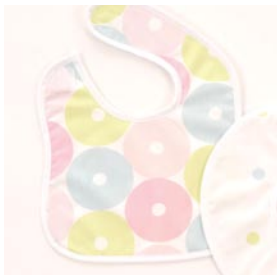
1. basic bib