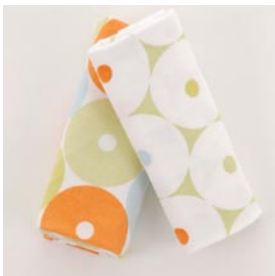
5. receiving blankets