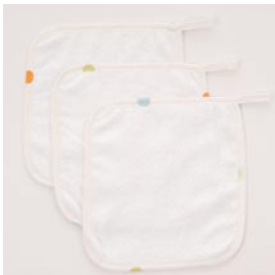
2. face cloths