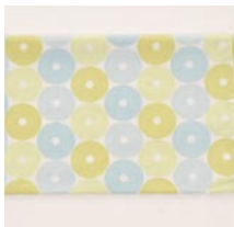
8. crib sheet