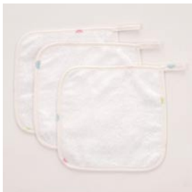
2. face cloths