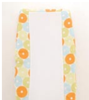
14. sleep cozy

13. sleep cozy: Keep baby warm while he/she sleeps with our sleep cozy. 2-way zipper and snap closures for easy changing. Our multiple snaps allow for adjusting the length for a safe, well-fitted sleep. 100% cotton lined with soft 100% poly fleece. Size S/M/L/XL. 14. change pad cover: Our coolest change pad cover ever really rounds out the look of your nursery with a crisp 100% cotton trimmed terry cover.