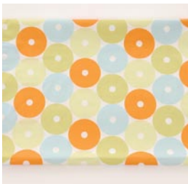
8. crib sheet