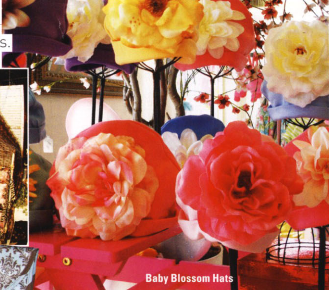
Baby Blossom Hats