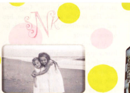
Feel Good Frames